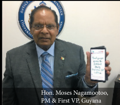
Hon. Moses Nagamootoo, PM & First VP, Guyana