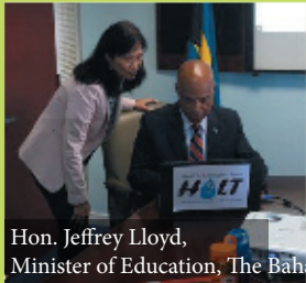
Hon. Jeffrey Lloyd, Minister of Education, The Bahamas