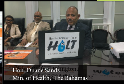
Hon. Duane Sands Min. of Health, The Bahamas