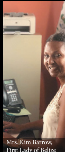
Mrs. Kim Barrow, First Lady of Belize