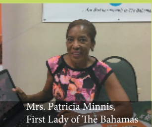
Mrs. Patricia Minnis, First Lady of The Bahamas