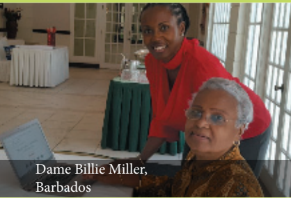
Dame Billie Miller, Barbados